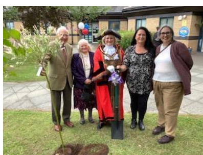
M Perfect to attend and plant our

With the COVID situation in school much improved as the Summer Term progressed, we were also able to celebrate the Queen's Jubilee with a whole host of activities, competitions and events which were judged by members of our